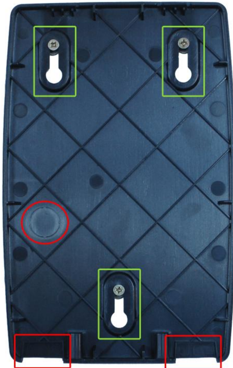
Back plate showing key holes in green and breakouts in red